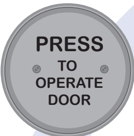
#59R4-P (Stainless Steel with Black Paint Filled Legend)