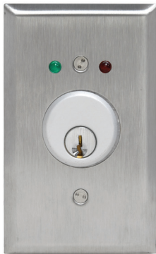
#830-L-RG (2 3/4" x 4 1/2" Face Plate)