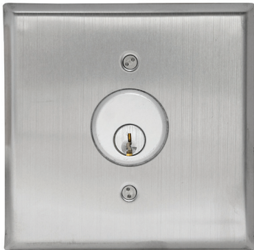
#830 (4 1/2" x 4 1/2" Face Plate)