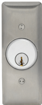
#830-N (1 11/16" x 4 1/2" Face Plate)