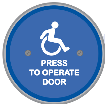
#59R6-H (Blue Powder Coat with White Paint Filled Legend)