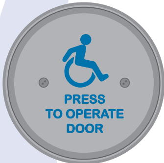
#59R6-HSS (Stainless Steel with Blue Paint Filled Legend)