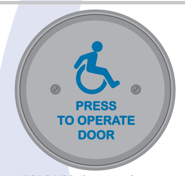
#59R6-HSS (Stainless Steel with Blue Legend)