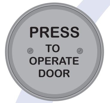
#59R6-P (Stainless Steel with Black Legend)