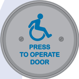
#59R4-HSS (Stainless Steel with Blue Paint Filled Legend)