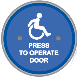
#59R4-H (Blue Background with White Legend)