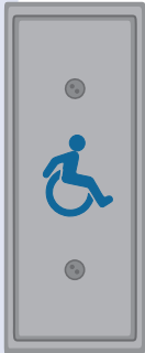
#59J-WSS (Stainless Steel with Blue Paint Filled Legend)