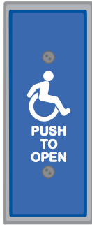
#59J-H (Blue Powder Coat with White Paint Filled Legend)