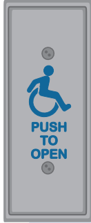
#59J-HSS (Stainless Steel with Blue Paint Filled Legend)