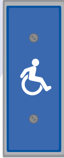
#59J-W (Blue Powder Coat with White Paint Filled Legend)