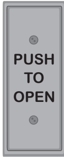
#59J-P (Stainless Steel with Black Paint Filled Legend)