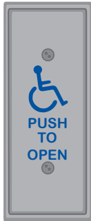
#59J-HSS (Stainless Steel with Blue Paint Filled Legend)