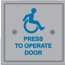
#59-HSS (Stainless Steel with Blue Paint Filled Legend)