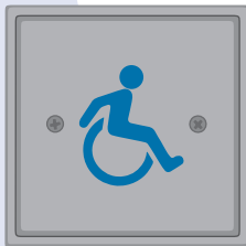
#59-WSS (Stainless Steel with Blue Paint Filled Legend)