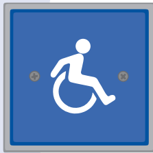
#59-W (Blue Powder Coat with White Paint Filled Legend)