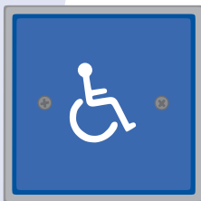
#59-W (Blue Powder Coat with White Paint Filled Legend)