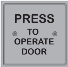
#59-P (Stainless Steel with Black Paint Filled Legend)