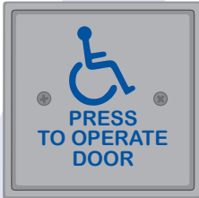
#59-HSS (Stainless Steel with Blue Paint Filled Legend)