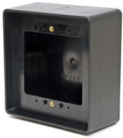
1015 SURFACE BOX