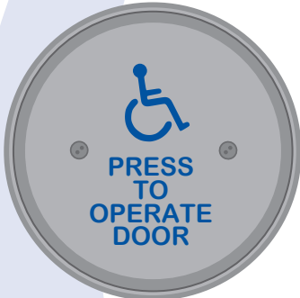
#59R6-HSS (Stainless Steel with Blue Paint Filled Legend)