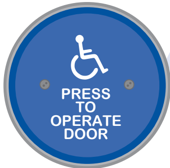
#59R6-H (Blue Powder Coat with White Paint Filled Legend)